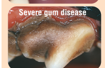
Progression of gum disease