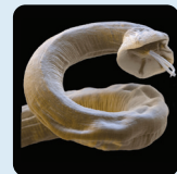
Electron micrograph of an adult lungworm (You won't see them as they live in the lungs!)